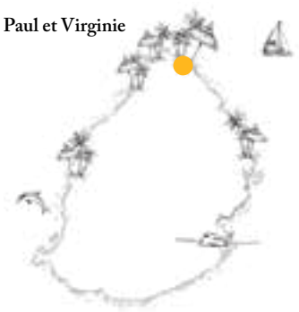
Veranda Paul et Virginie

Nestled in the quaint fishing village of Grand Gaube, this adults-only hotel is the perfect spot for couples looking for an intimate and quiet cocoon, with unique activities and experiences to discover the region.