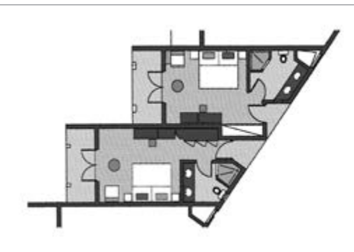
*2 layouts available for the Comfort Family rooms