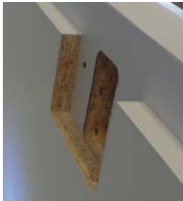
Remove screws and metal plate inside drawer.