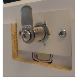
Photo indicates Arm position for locked Cam Lock.