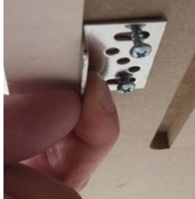
Slide L-bracket forward or backward so that the CAM arm is 1/8" or less away from the metal leg when in the locked position