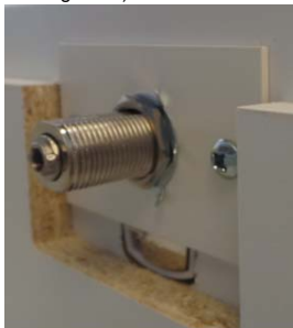
Bend all 3 prongs on Anti-Rotation washer over the Nut