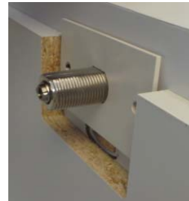
Place metal plate over the Cam lock