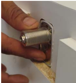
Insert Cam Lock into recess opening in door. Be sure to test Cam with programmed IR Sounder Key and make sure lens shows locked position (solid black background)