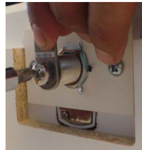
Place Cam Arm on the barrel. BE SURE TO ORIENTATE THE CAM ARM TO THE LOCKED POSITION. THIS IS STRAIGHT UP. HAND TIGHTEN THE ARM ON THE CAM BARREL WITH A SCREWDRIVER. DO NOT USE POWER TOOLS!