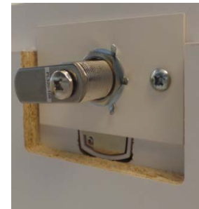
Photo indicates Arm position for unlocked Cam Lock