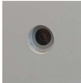
Make sure lock is inserted in the correct direction by checking alignment of IR lens in hole from the front. OBSERVE IR LENS TO CONFIRM LOCKED