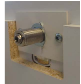
Place Anti-Rotation washer around Cam barrel