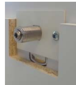
Replace screws holding plate in place