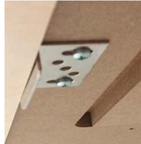
Tighten screws to secure L-bracket