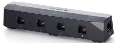
Alarm Accessory Box