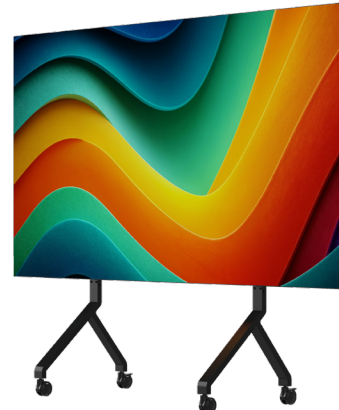
Shown with optional cart. Sold separately.

HDMI x2 Optical S/PDIF 3.5 mm line level audio LAN control USB-B (for service)