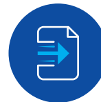
Faster First Page Out