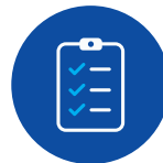
Fewer Steps & Parts