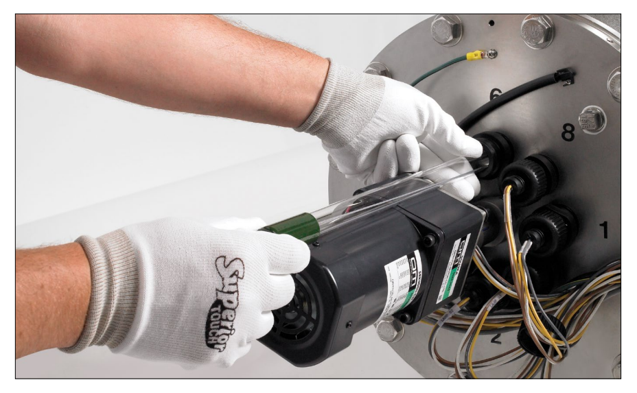
The TrojanUVFit®AOP lamps are easily replaced in minutes without the need for tools.