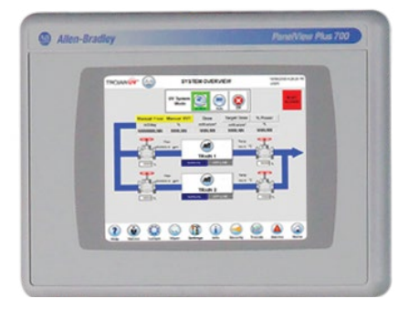
The PLC-based controller combines sophisticated system operation and reporting with an operator-friendly, touchscreen display.