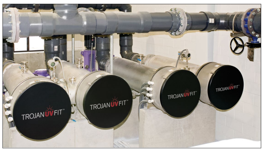
Chambers can be installed in parallel or in series for increased design and installation flexibility.