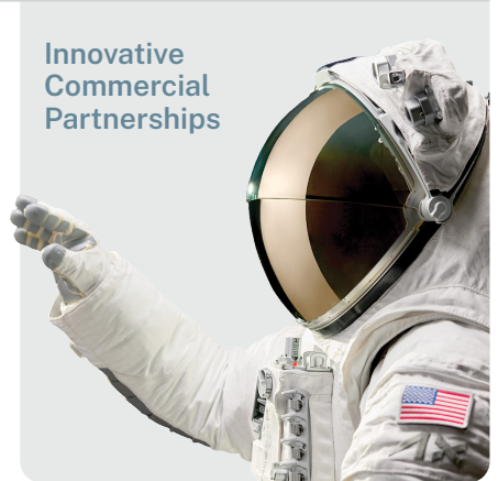
Innovative Commercial Partnerships