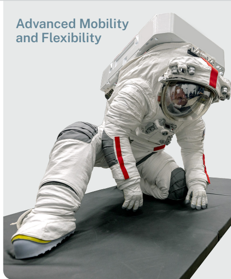
Advanced Mobility and Flexibility