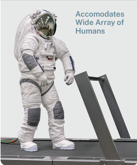
Accommodates Wide Array of Humans