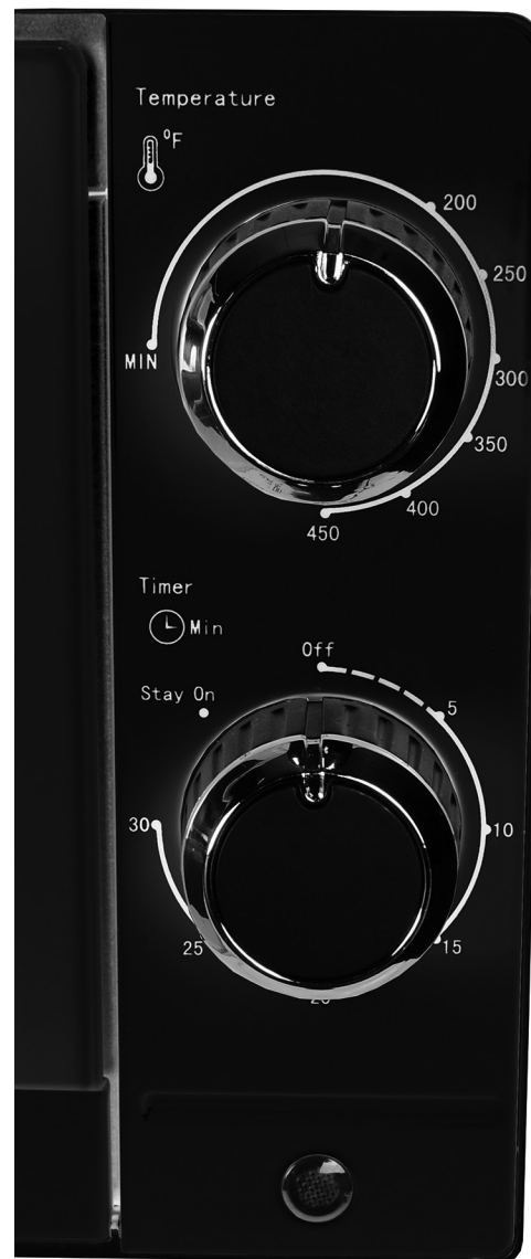
Temperature Control Knob