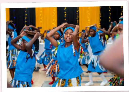
Students perform a cultural dance at the school's main hall at Kibera School for Girls

SHOFCO's education program provides free education to girls in Kenya's urban slums through its Girls Leadership Academies. The curriculum emphasizes leadership and holistic development, enhancing students' emotional growth and resilience. Post-graduation, SHOFCO supports students' placements in prestigious Kenyan and U.S. high schools, offering scholarships and mentorship programs. For U.S.-bound students, SHOFCO provides intensive preparatory training, logistical support, and cultural orientation.