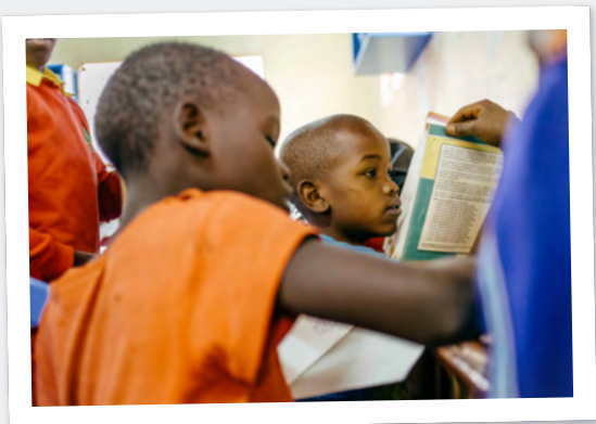
Children gather to select books to read from the library shelves. Many students use the library to access learning materials they cannot access at home.