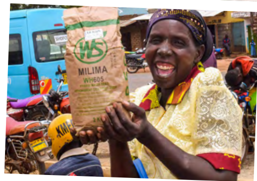
A jubilant woman in Western Kenya celebrates receiving maize seeds for her farm through SUN. With many subsistence farmers in the region, Kenya's food basket relies on farmers like her in the Western parts of the country