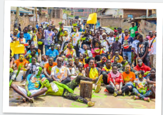
Young people gather to champion and advocate for an end to gender-based violence and to use art to share messages for mental health support in their communities

SHOFCO’s interventions to combat GBV include door-to-door visits, awareness campaigns, legal and mental health support, and group therapy, supplemented by rehabilitative wellness and livelihood programs. Our Gender and Inclusion department collaborates with Kenya’s State Department of Gender and has contributed to the nation’s first GBV conference and a strategic five-year plan to end GBV.