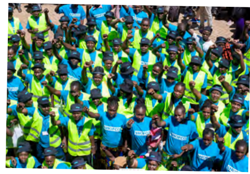
"SUN! Power!" Community members raise their fists in unison, demonstrating their belief in their inherent power and community-led change

SUN empowers community members to become leaders and advocate for their rights, providing resources and tools for socioeconomic improvement. It facilitates micro-level initiatives like peer-to-peer savings and entrepreneurial funds, and macro-level advocacy like large-scale peace marches. Starting with 50 members in Kibera, SUN has grown to encompass over 1.5 million people across 13 Kenyan counties, organizing extensive community actions, including effective responses to the COVID-19 pandemic through public awareness and health measures. This structured community effort enhances civic engagement and fosters economic empowerment, significantly impacting slum residents' lives.