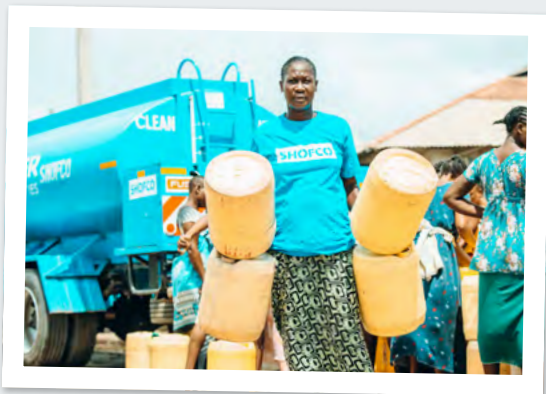
A resident poses for a picture as she joins her neighbors in accessing clean water for domestic use from SHOFCO's clean water tanks