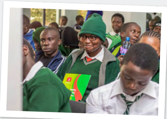
A student smiles while participating in a Math Symposium for Kibera Schools organized by SHOFCO's Library Department

Today, SHOFCO operates 17 community libraries across regions including Kibera, Mathare, Mukuru, and Korogocho. Our libraries provide literacy programs for all ages, from storytime for children to writing workshops for adults, and host community engagement events like book clubs. They also offer unique resources such as a large collection of rare books, specialized technology, local history materials, and creative resources like music and art materials.