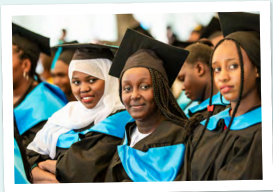
Two young women graduate from the Sustainable Livelihoods program in Mombasa. Graduates will use their skills to create businesses or achieve gainful employment