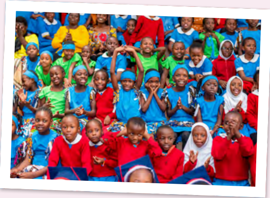
Students gather at the main hall for the 2023 PRE-K Graduation at Kibera School for Girls