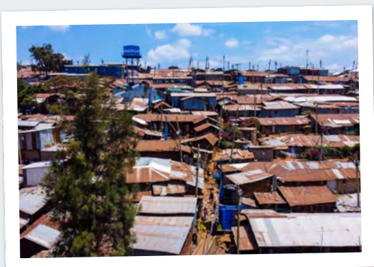
A SHOFCO-blue water tank stands high on the horizon overlooking Kibera informal settlements. Residents will gather at these tanks to access clean and affordable water for domestic use.

SHOFCO has transformed water access in urban slums by installing state-of-the-art water purification equipment and implementing 18km of aerial piping, which safely delivers 189 million liters of clean water annually. This innovative setup prevents contamination by elevating the pipes above potential sources of sewage and theft. Over 40,000 households benefit daily, either directly from SHOFCO kiosks or through local vendors, with water costs reduced more than threefold compared to rates previously charged by cartels.