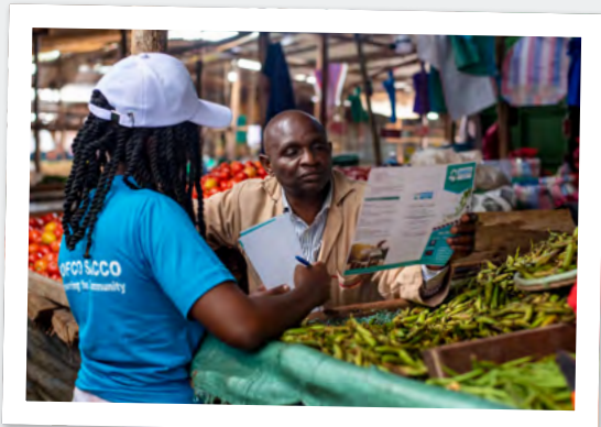
A SHOFCO SACCO staff member interacts with a small business owner at the local fresh produce market

SHOFCO’s financial services address the severe income inequality in slums, offering residents tools to break the cycle of poverty. Initiatives like the Savings and Credit Cooperative (SACCO) and the Group Savings & Loans program enable savings and borrowing to grow economic activities. The SACCO provides loans ranging from $50 to $7,000 with minimal initial deposits, while the Group Savings & Loans has shown strong propensity for savings among members.