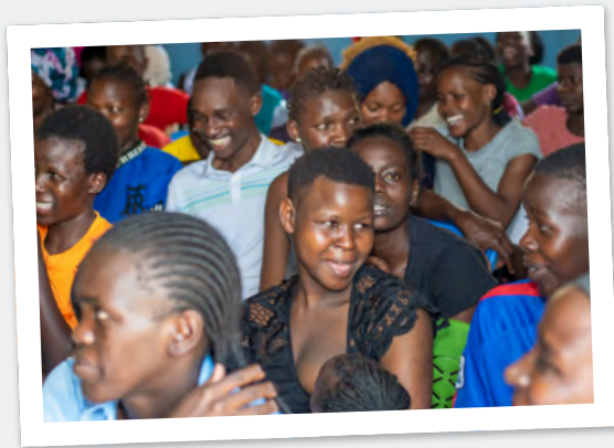
Community members gather during a sensitization exercise on gender-based violence (GBV)