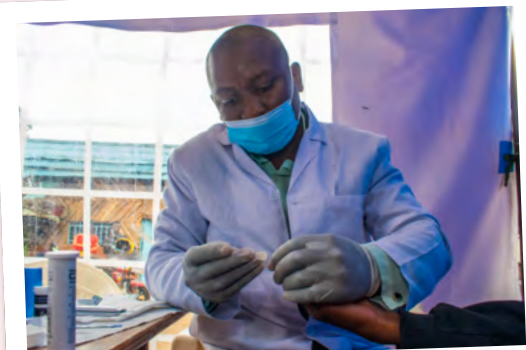
Medical staff from the SHOFCO clinic assists a patient during a health outreach exercise in Dagoretti, an informal settlement in Nairobi