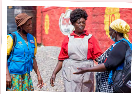
Community healthcare workers exchange notes before heading out to their communities

Our facilities, led by a dedicated team of over a hundred qualified staff, provide a lifeline to those in need. From clinical care and pharmacy to laboratories, nutrition, mental health, and radiology, we offer comprehensive, accessible, and affordable healthcare. During the COVID-19 pandemic, our 1,800 community health workers became frontline heroes, spreading vital messages and pioneering free testing and vaccination centers across four counties in Kenya, reaching 1.5 million lives and saving countless others.