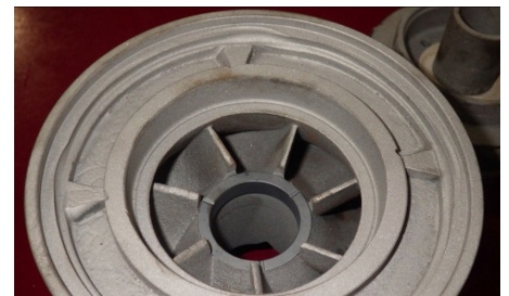
Diffuser with Erosion Buster® design shown fully intact.

For more information, contact your local Halliburton representative or visit us on the web at www.halliburton.com