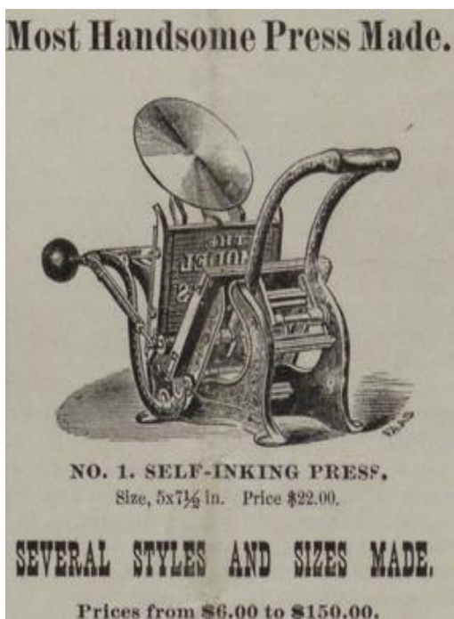
Model Printing Press." Amateur Newspaper Reporter and Printers' Journal , Mar. 1878, p. 8. American Amateur Newspapers

In the nineteenth century, a teenager could order a small press for printing cards 2 1/4" x 3 1/4" for $3, or move up to paying $90 for a deluxe rotary jobber with three inking rollers and flywheel for printing a sheet of paper 8 1/4" x 12 1/2". 5