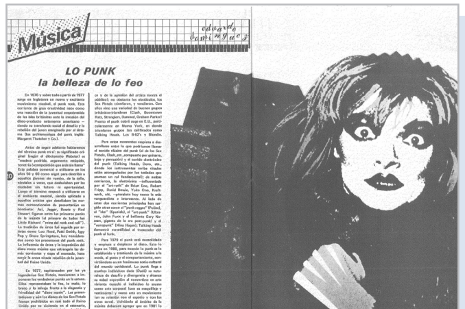
Venezuelan magazine calls Little Richard the queen of rock and roll and rock's first punk, Música , Marzo-Abril 1981, Boletín Informativo del Grupo Entendido , Caracas, Venezuela, Archives of Sexuality and Gender .

"I was greatly impressed by the amount of resources available, the kinds of resources Gale offered, and how easy it is to navigate Gale's databases."