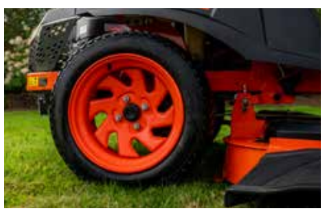
2 Use the dial to adjust the cutting height

Bold and robust, the rear wheel complements the Z200 Series overall appearance.