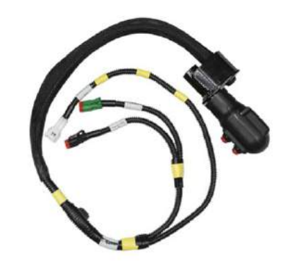
THIRD FUNCTION VALVE