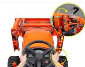
Step 4: Pull one lever to quickly and easily detach the hydraulic lines as a unit and store the coupler on the loader boom.