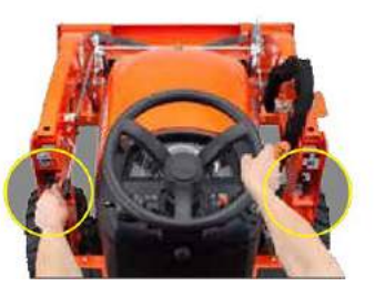
Step 2: Unlatch the loader latch levers to detach the front loader hooks.