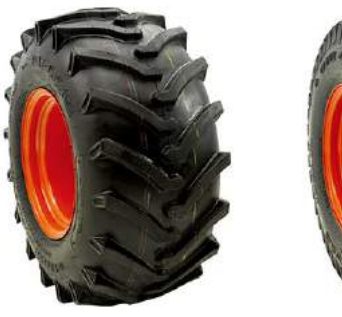
R1 BAR/AGRICULTURAL (BX1880, BX2380, BX2680 only)