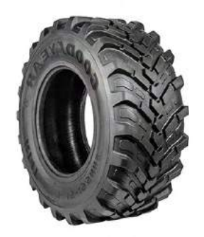
R14 HYBRID (BX2380, BX2680, BX23S only)