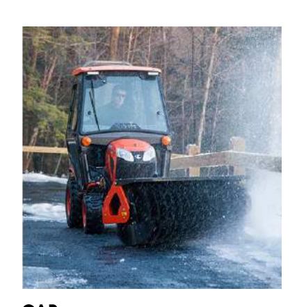
CAB (Snow Broom Shown)