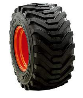
R4 INDUSTRIAL (BX2380, BX2680, BX23S only)