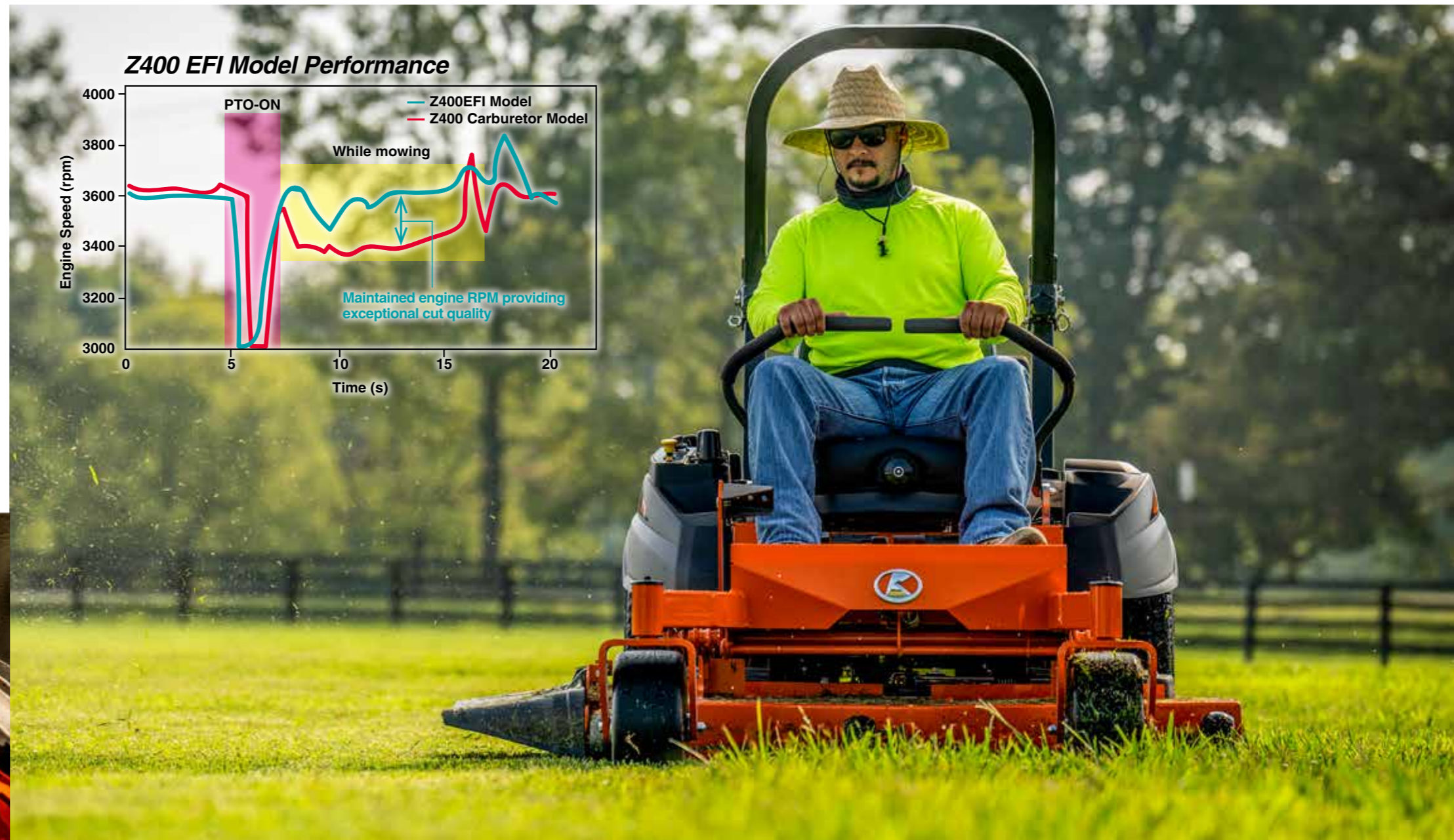
Z400 EFI Model Performance