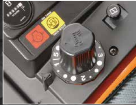
1/4" Increment Cutting Height Adjustment