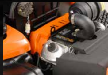
Removable Engine Cover

*When in use, consult operator manual and handle with care.