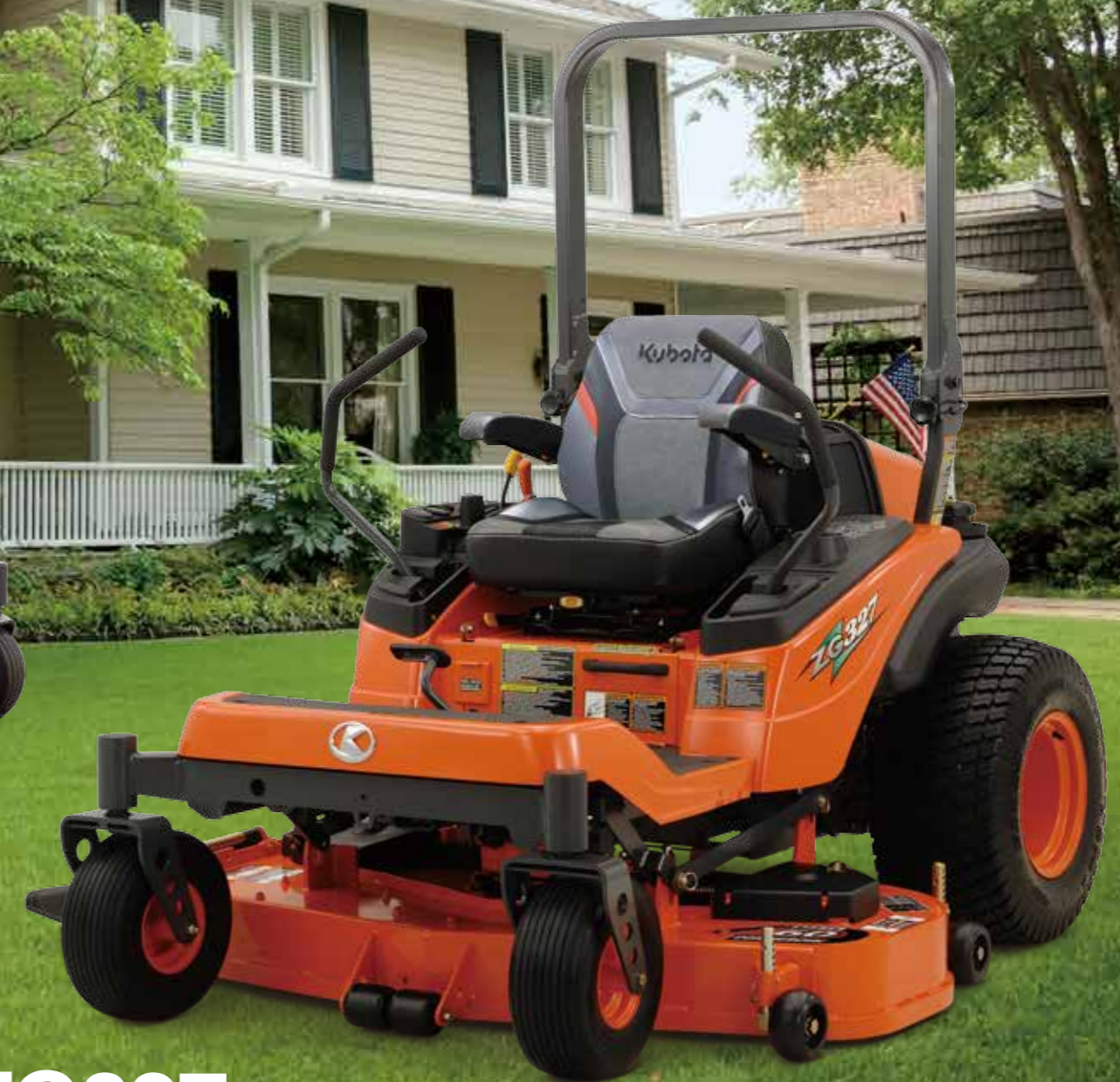
ZG327 with 60" deck