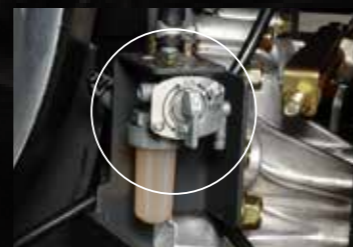
Carburetor Drain Cock*

*When in use, consult operator manual and handle with care.