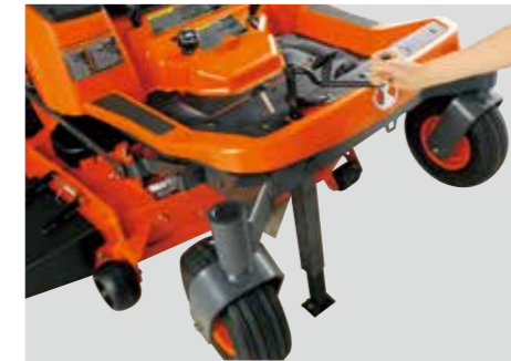
Maintenance Lift (Optional)

Maintenance doesn't get any easier. The seat panel lifts up for quick access to the HST, the hood opens for routine maintenance (adding oil, etc.), an operator platform hatch makes upper mower access a snap—and all three can be opened at once. Plus, Kubota's optional tilt-up lift feature is also available for routine maintenance underneath the mower.