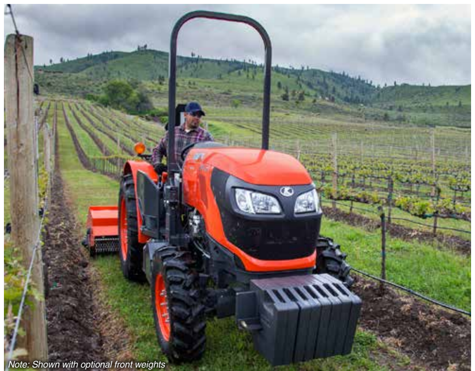
Note: Shown with optional front weights