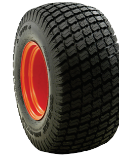
R3 TURF (All models)