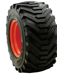
R4 INDUSTRIAL (BX2380, BX2680, BX23S only)