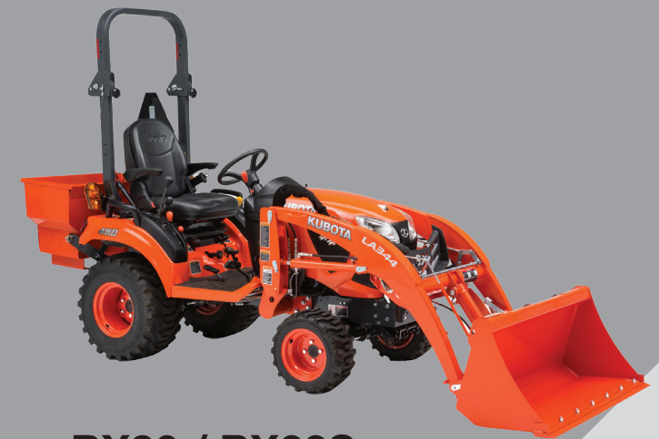
BX80 / BX23S 2017-Today

Started offering drive over mower decks and moved the location of the brake pedal to the left side for more comfort. The BX70 also introduced the quick hitch.