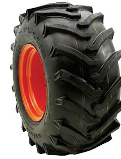
R1 BAR/AGRICULTURAL (BX1880, BX2380, BX2680 only)