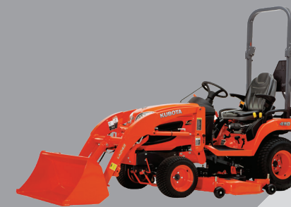
BX70 / BX25D-1 2015

BX60 introduces a higher horsepower model within the BX Series.