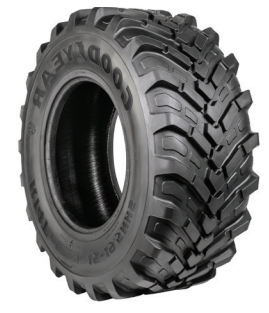
R4 HYBRID (BX2380, BX2680, BX23S only)