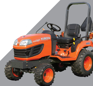
BX60 / BX25 2009

Kubota expands the offering of the sub-compact by introducing the BX30 Series and was one of the first TLB models.