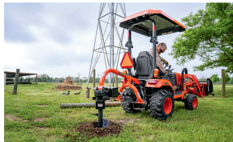
POST HOLE DIGGER