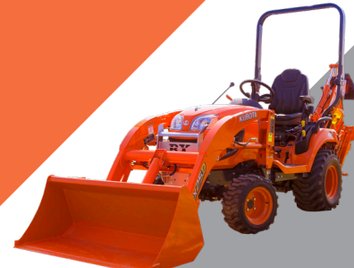
BX70 / BX25D 2013

Further modern innovations and styling with the release of the BX50 Series.