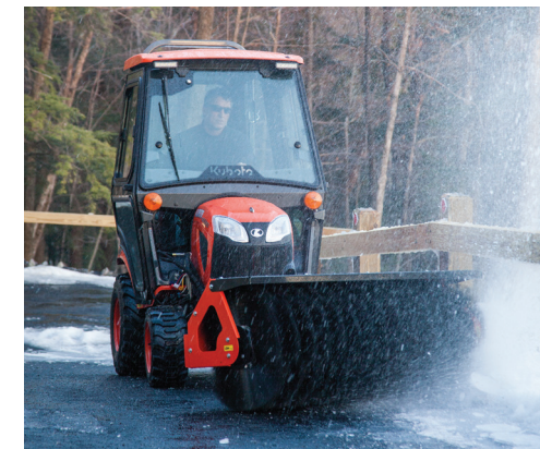
CAB (Snow Broom Shown)