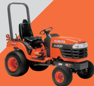
BX30 / BX230 2004

Introduced the Swift-Tach loader, single piece hood redesign and offers a third function valve kit. The R14 tires were also introduced in 2021.