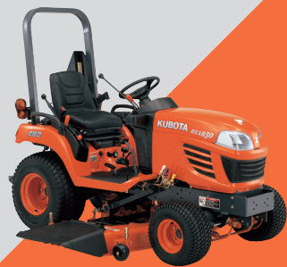
BX50 / BX24 2006

Kubota enters North America with the sub-compact tractor category.