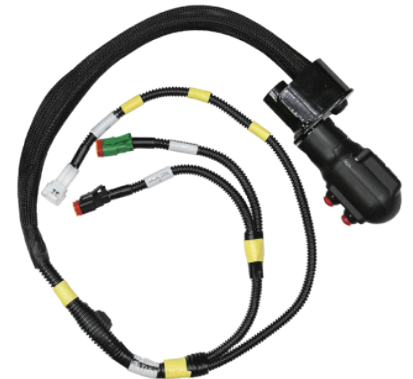
THIRD FUNCTION VALVE