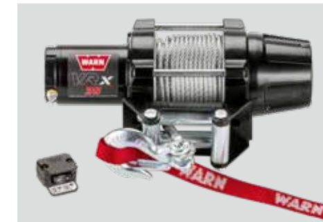
WARN VRX 3,500 lb Winch