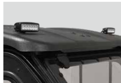
Front LED Work Lights