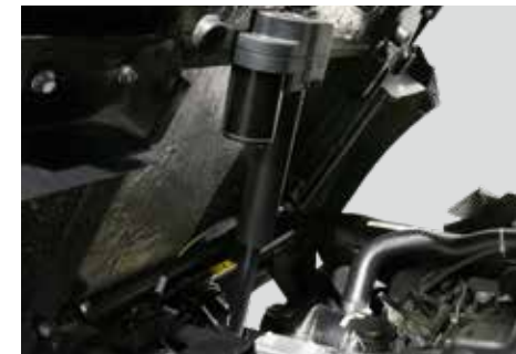
Cargo Bed Lift Kit