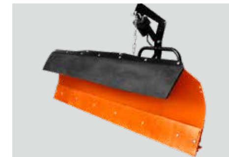
V4308A 60" Snow Plow