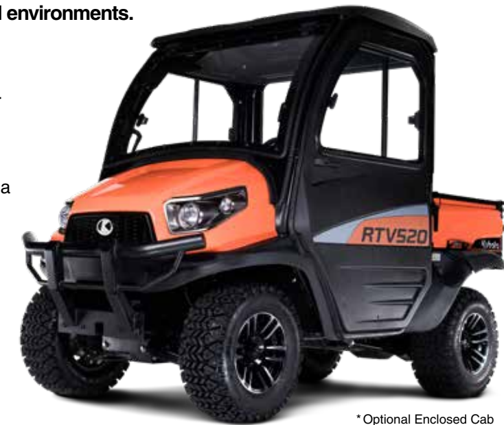
* Optional Enclosed Cab

The 360-degree crank and two axis balancer significantly reduces the vibration from the engine, also reducing the feedback to the drivers hands and arms. Drivers can stay focused on the job at hand, even after a long day of work.