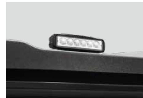
Rear LED Work Light