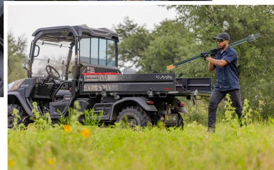
Full Steel Cargo with Spray-on Bed Liner