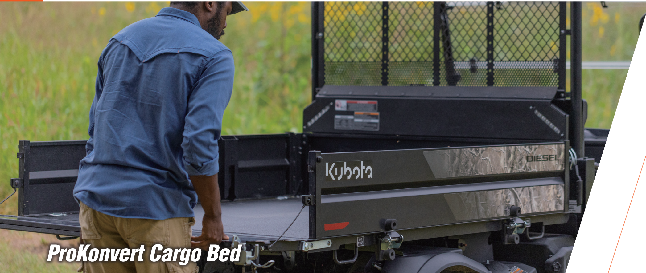
ProKonvert Cargo Bed