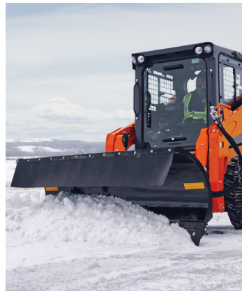
TRIP EDGE BLADE