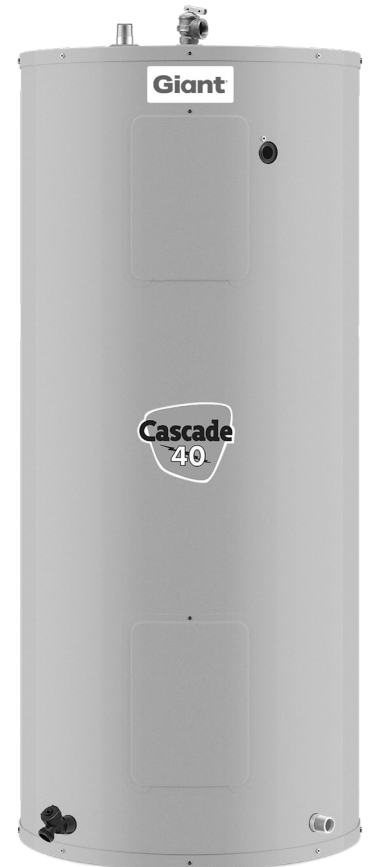
Illustrated model: 152B-3F7M