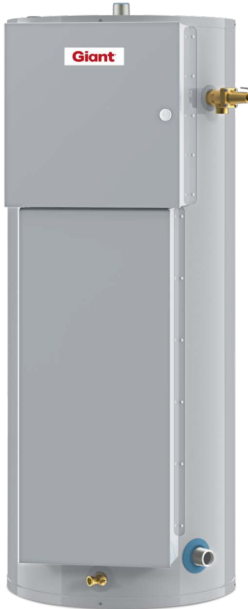
Illustrated model : 112

Heavy Duty (3, 6 or 9 elements) including 600V