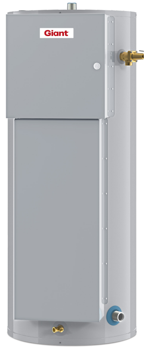
Illustrated model: 112

Specially welded feature makes it easy to change the elements.