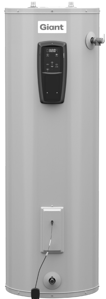
Illustrated model: 167-EEC