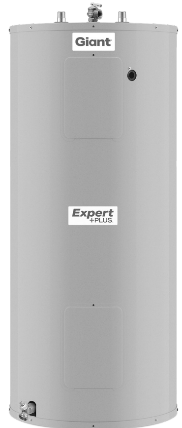
Illustrated model: 152STE-3S8M-E8