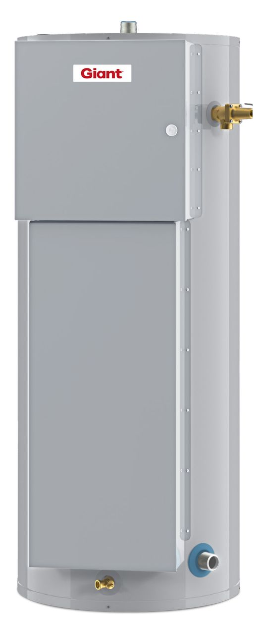
Illustrated model: 112

4.5, 5 and 6*kW (2 elements), 6, 9, 10 and *Exception 208V/1ph