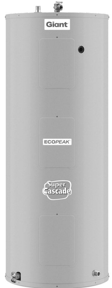
Illustrated model: 172EPS-3F8M