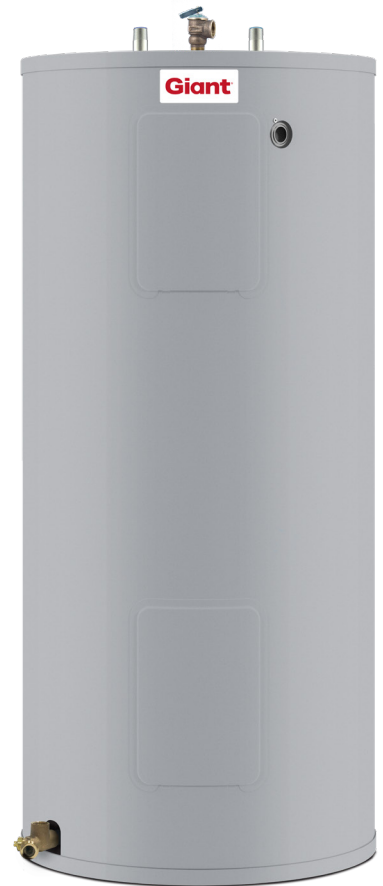
Illustrated model: 152ETE-9G7M