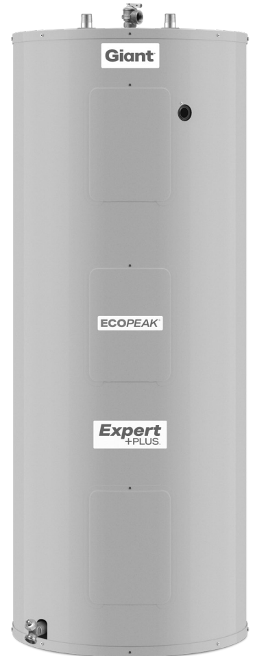
Illustrated model: 172STPS-3S8M-E8