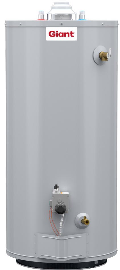
Illustrated model: UG40-40S3-N2 250