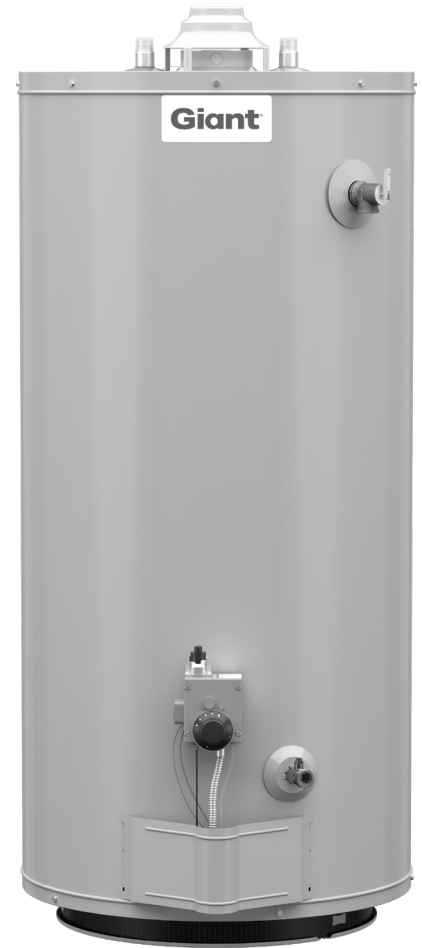
Illustrated model: UG40-40S3-N2 250