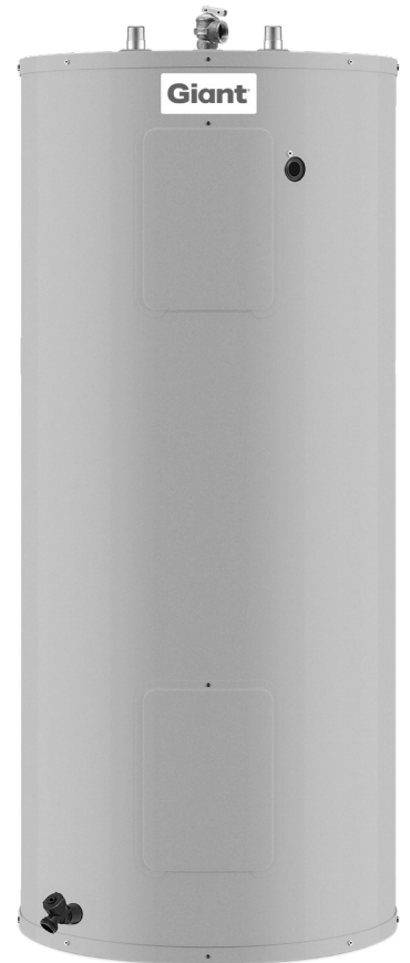
Illustrated model: 142STE-3F7M