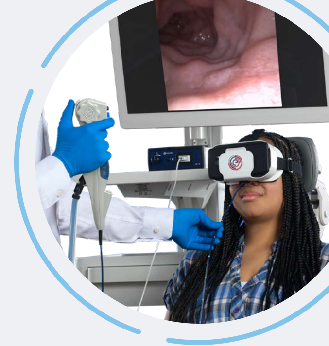
Model LE 110 110 cm