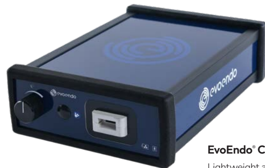
EvoEndo® Controller Lightweight and portable at 6" x 8.5" and 2 lbs.