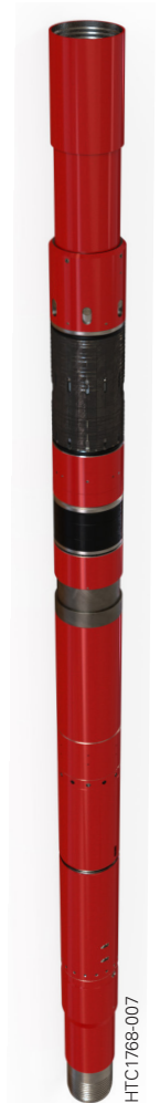
X-Trieve™ HC hydrostatic-set retrievable packer