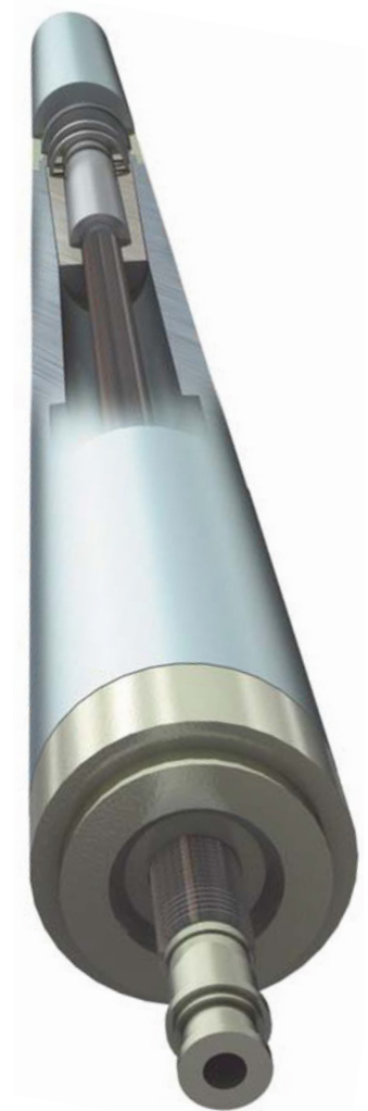
Downhole Power Unit –Intelligent Series

The DPU-I tool's motion control and high linear force provides an alternative to jointed pipe or coiled tubing well interventions. At the well site, the tool can be easily adapted to set or retrieve devices based on intervention requirements.