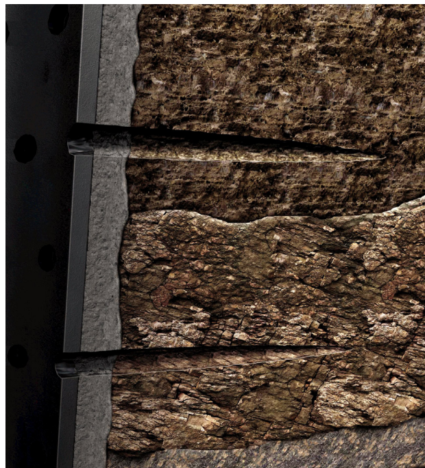
Understanding and prediction of dynamic and static pressure behavior become paramount when perforation damage cleanup and tunnel integrity are necessary.