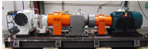
HD INDUSTRIAL PACKAGE UP TO 1600 GPM