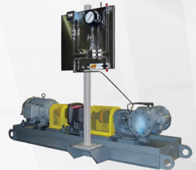
OIL FIELD SERVICE API FLUSH PLANS