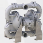
STANDARD & HEAVY DUTY AODD