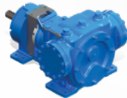
API 676 PUMP