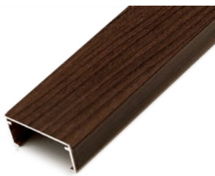
Click 40 1.57" W x 0.70" D x 19 ft. L 0.047" thick