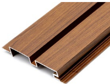
Universal 4+4 4.72" W x 0.70" D x 19 ft. L 0.047" thick