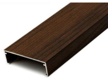
Click 60 2.36" W x 0.70" D x 19 ft. L 0.047" thick