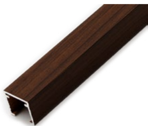
Click 20 0.78" W x 0.70" D x 19 ft. L 0.047" thick