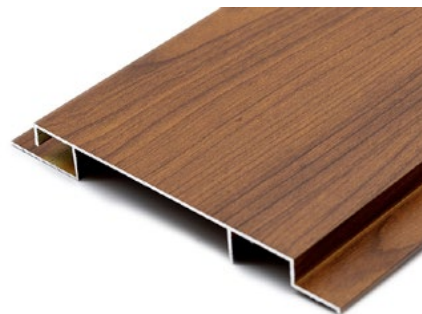
Universal 140 5.51" W x 0.70" D x 19 ft. L 0.047" thick