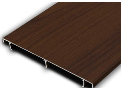
Click 180 7.20" W x 0.72" D x 19 ft. L 0.047" thick