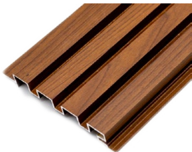
Universal 2+2 5.51" W x 0.70" D x 19 ft. L 0.047" thick