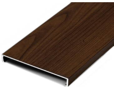
Click 120 4.80" W x 0.72" D x 19 ft. L 0.047" thick