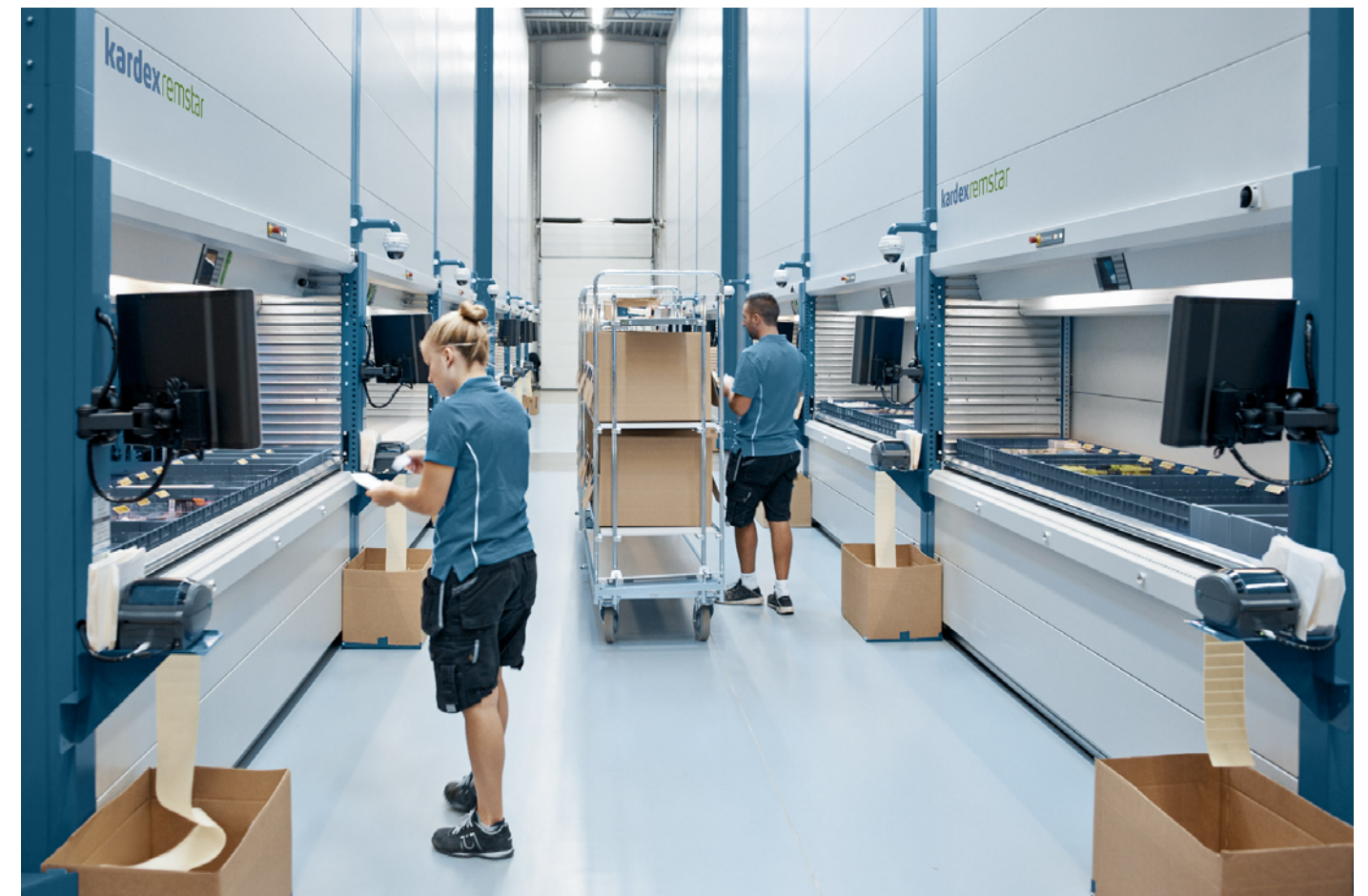
Order picking with Kardex Shuttles