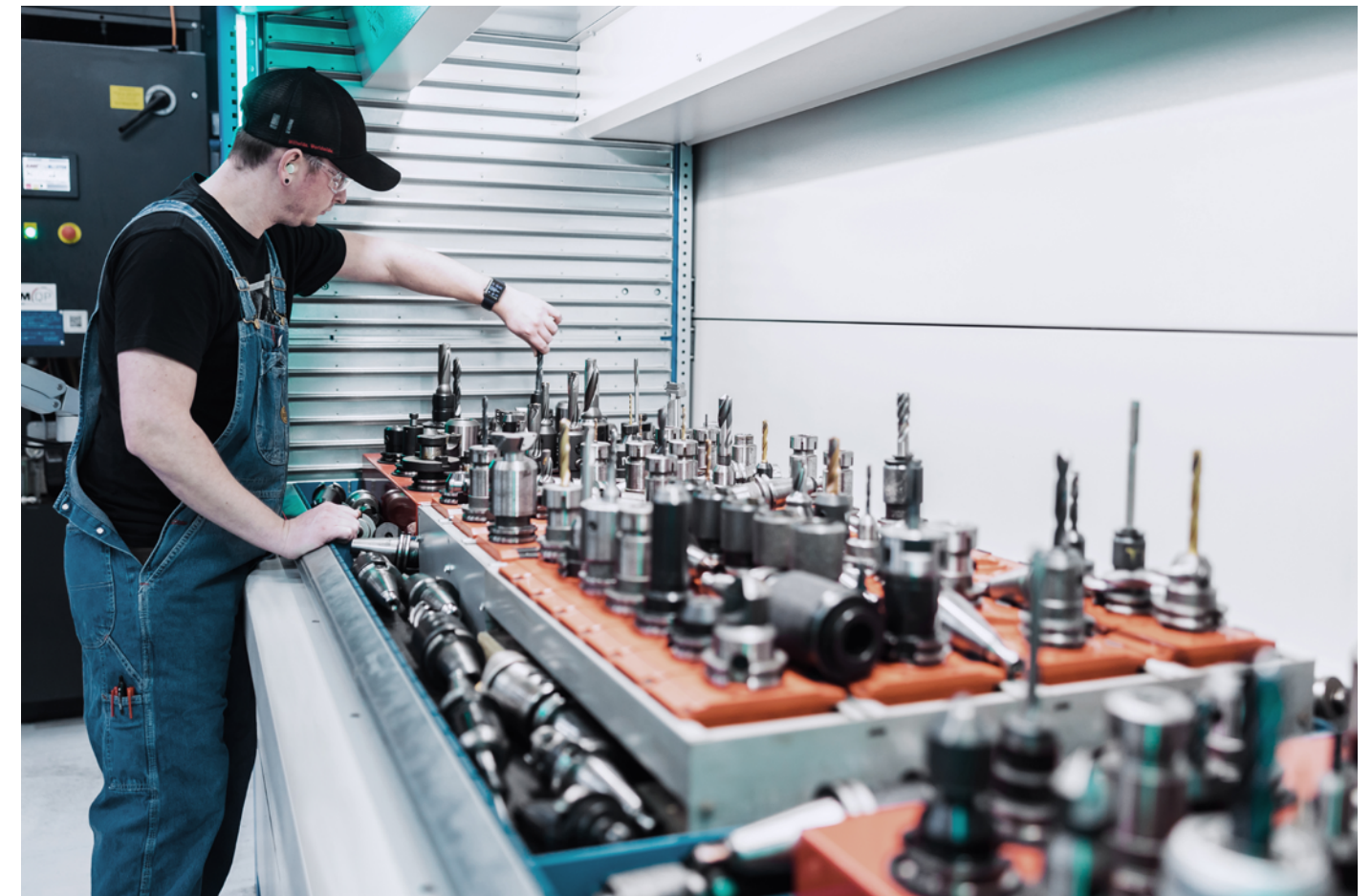
Tool storage with Kardex Shuttles

Further options and storage environments with air conditioning, clean room, fire protection or esd versions are available.