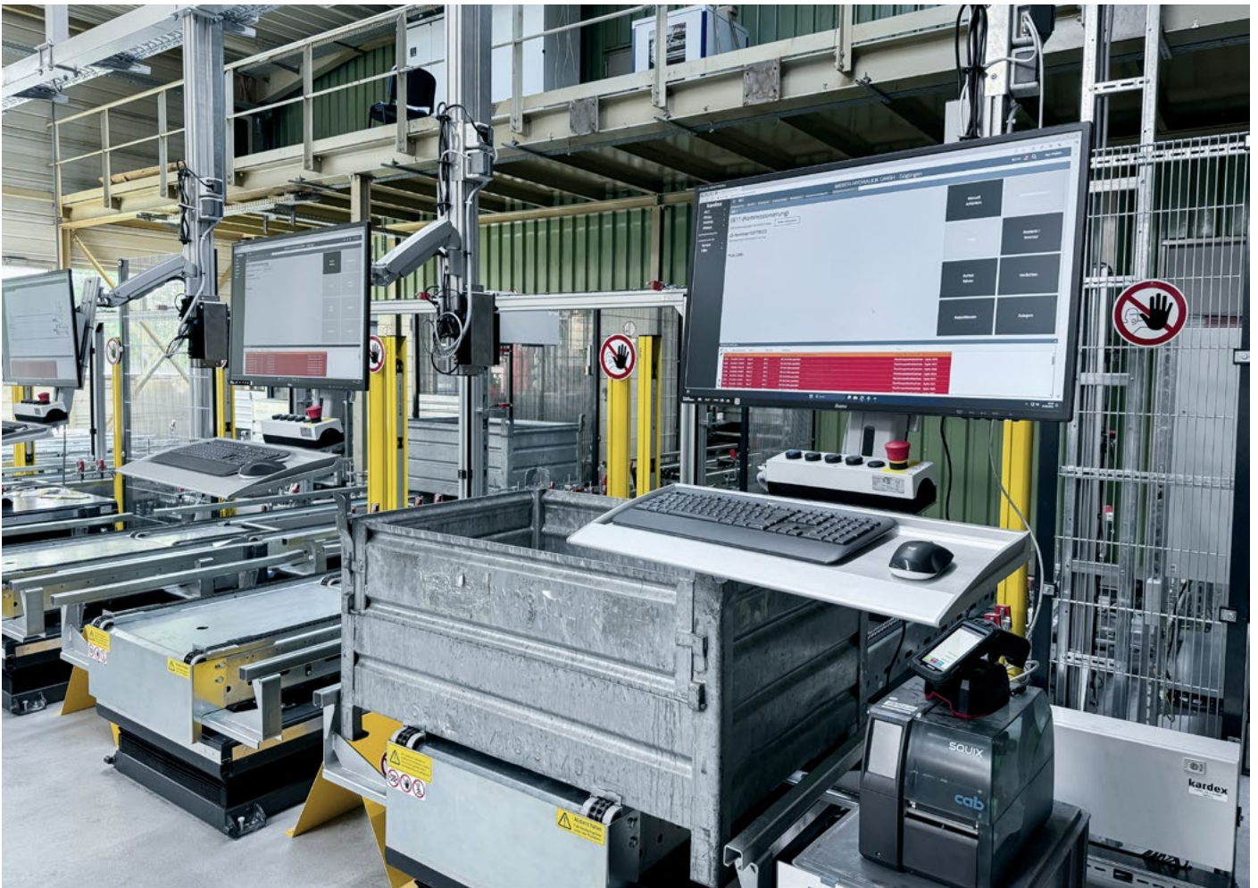
Picking before and after. Improvements were also made in the picking area: This now takes place at five ergonomic, height-adjustable workstations.