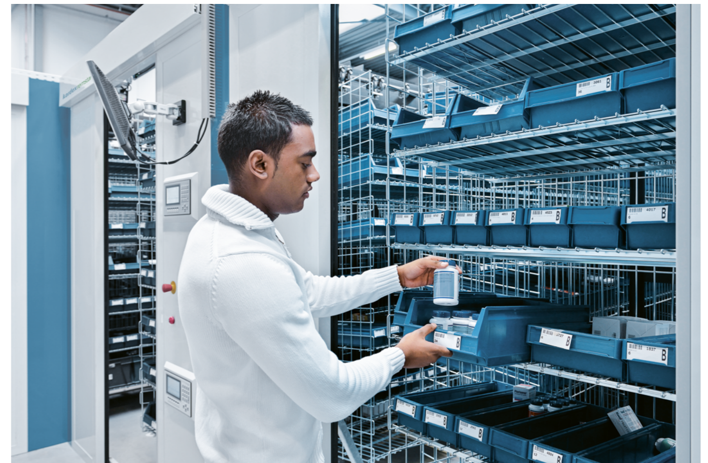
Order picking with Kardex Horizontal Carousels