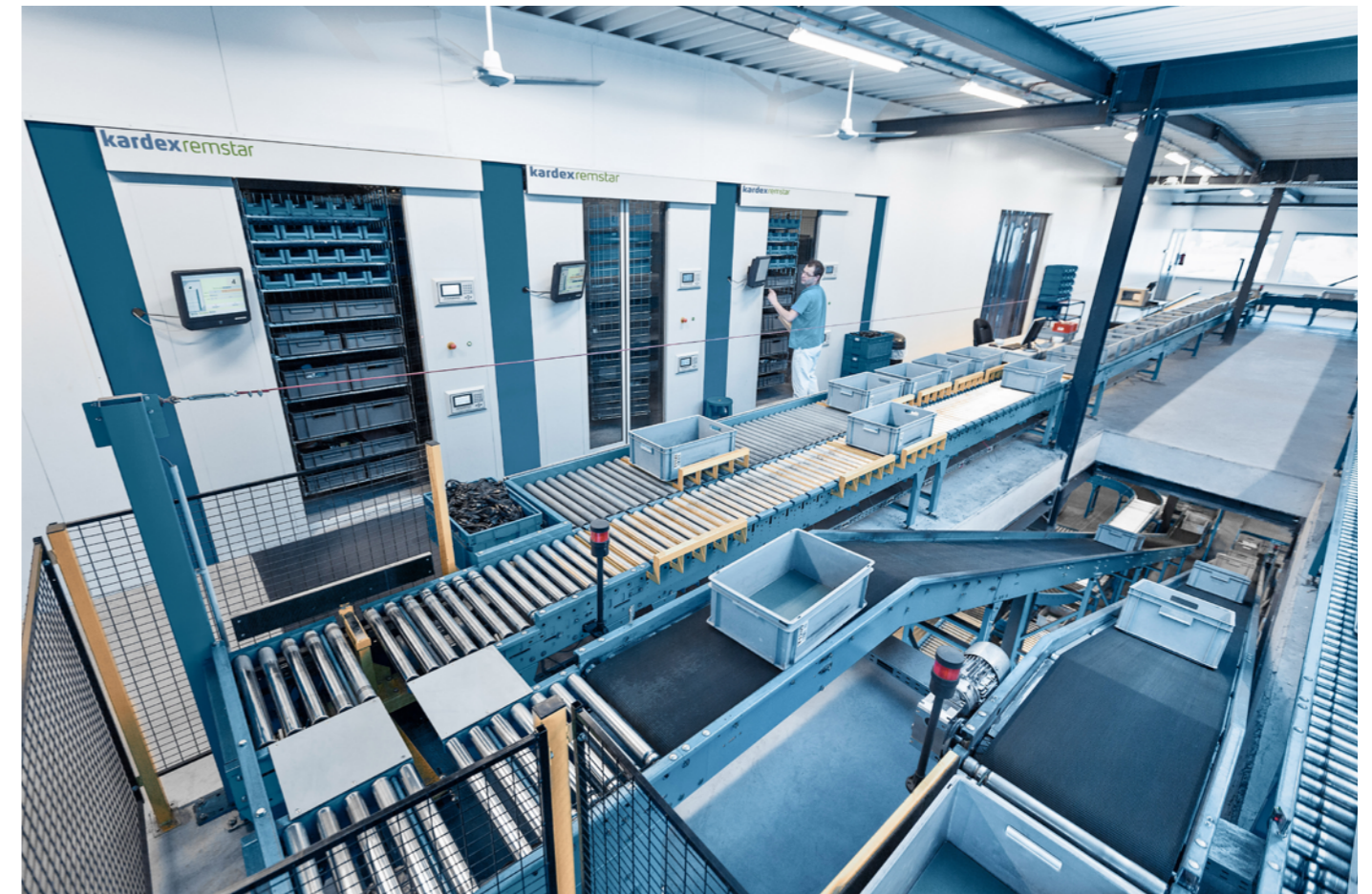
Kardex Horizontal Carousels with conveyor system

Further options and storage environments with air conditioning, fire protection or esd versions are available.