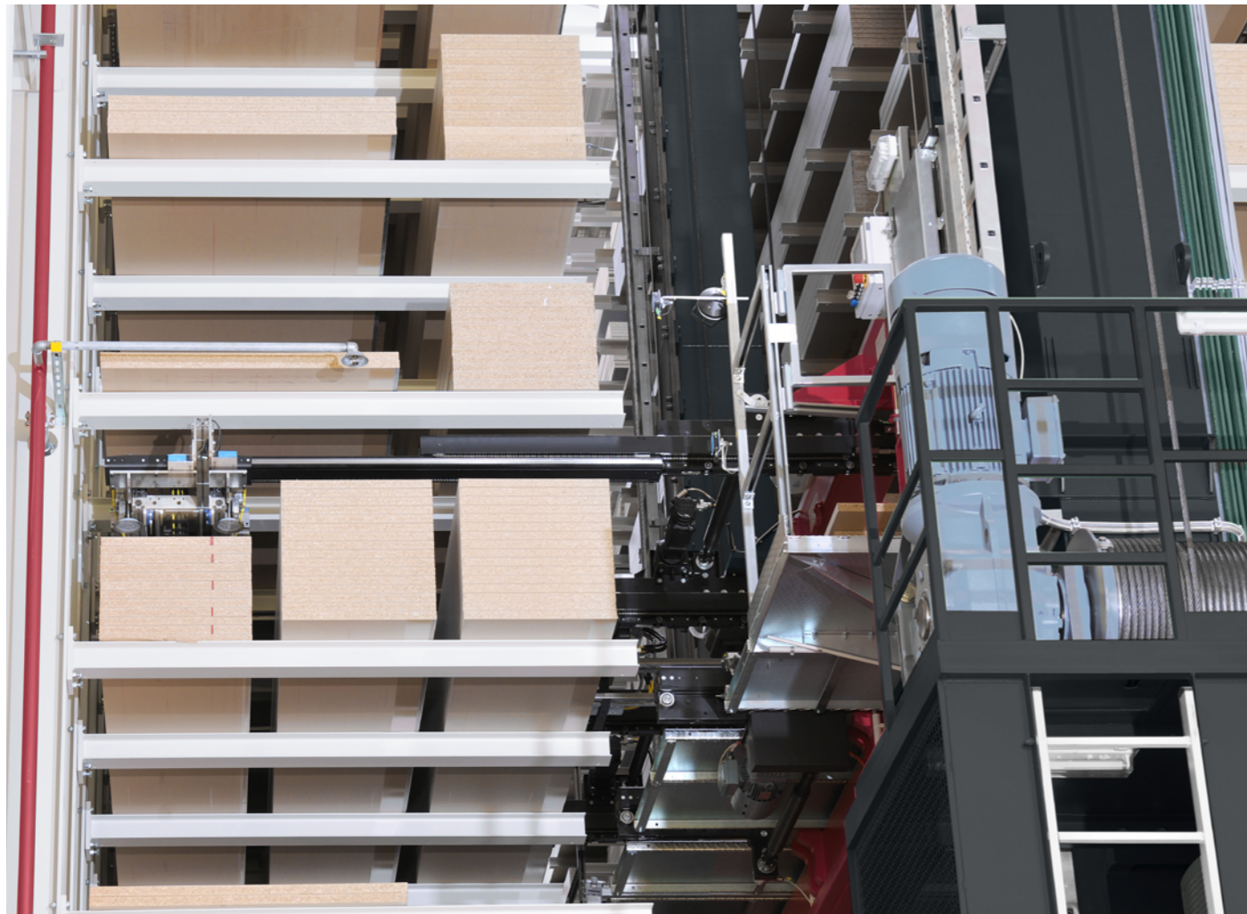
Die Platten werden direkt im Lager mithilfe von Saugtraversen aufgenommen

Similar to the self-propelled platform, the fully-automated SRM also features a suction cross-beam as the load pick-up device. As the warehouse is higher, it is possible to store more articles in a smaller space. This minimizes travel distances and travel times resulting in a significantly higher picking performance. In fact, a German kitchen manufacturer recorded their peak value to date at a production location.