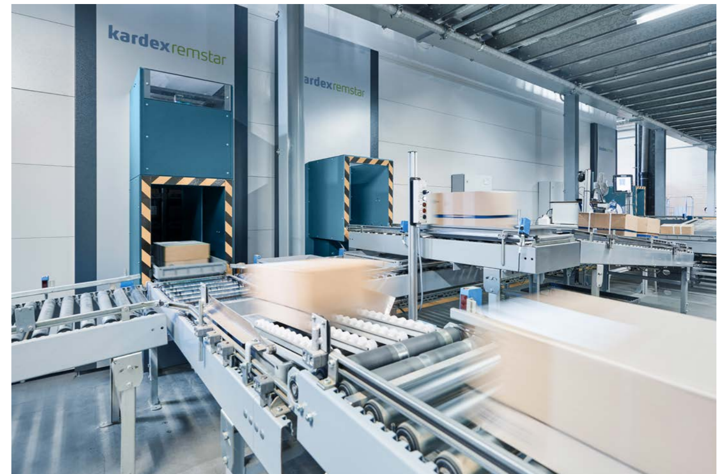
Order consolidation with automatic conveyor connection