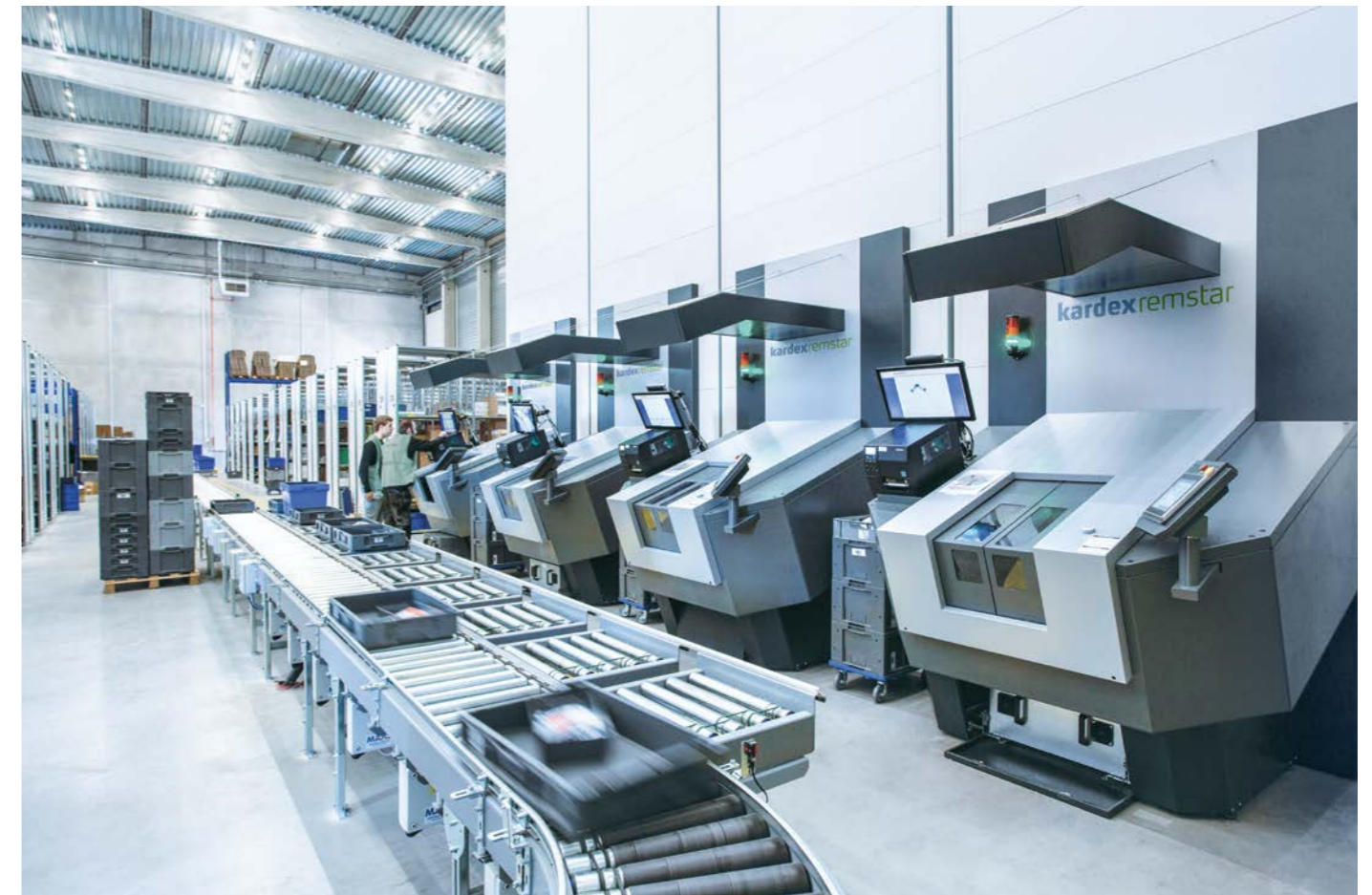
Order picking with turntables and a conveyor system with put locations

Further options and storage environments with air conditioning, fire protection or esd versions are available.