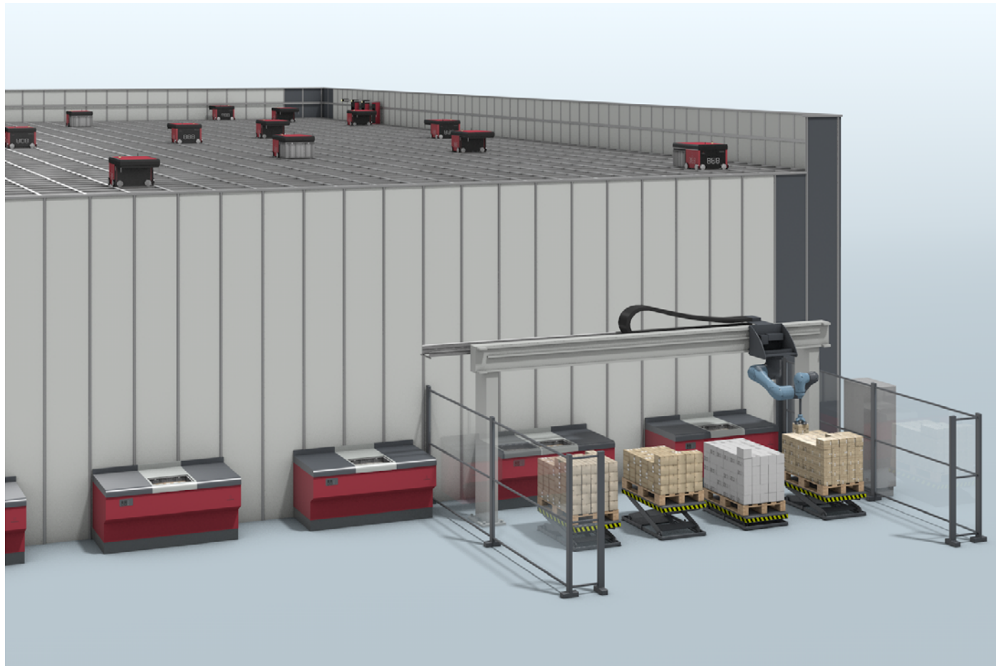
Automated solution with pick and place robotics for (de-)palletizing