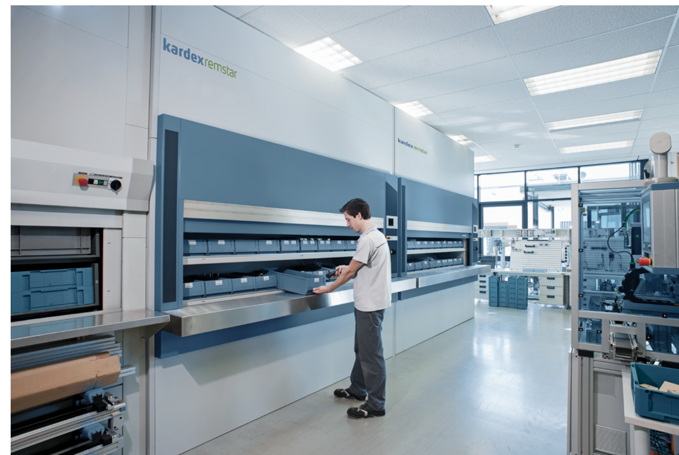
Spare parts management with Kardex Megamats

Further options and storage environments with air conditioning, clean room, fire protection or esd versions are available.