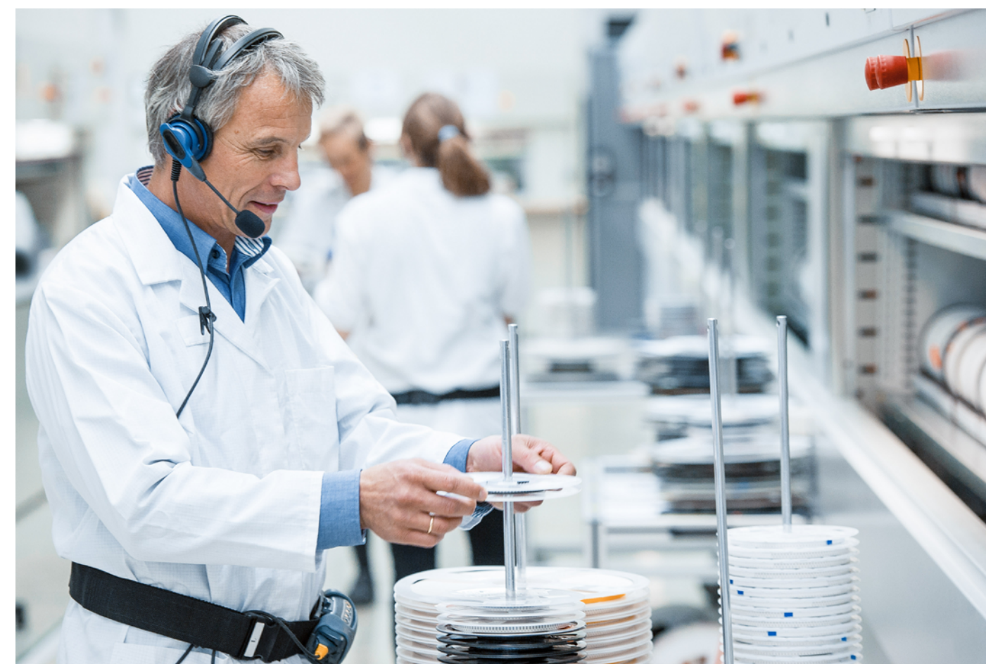
SMD handling with Kardex Megamats