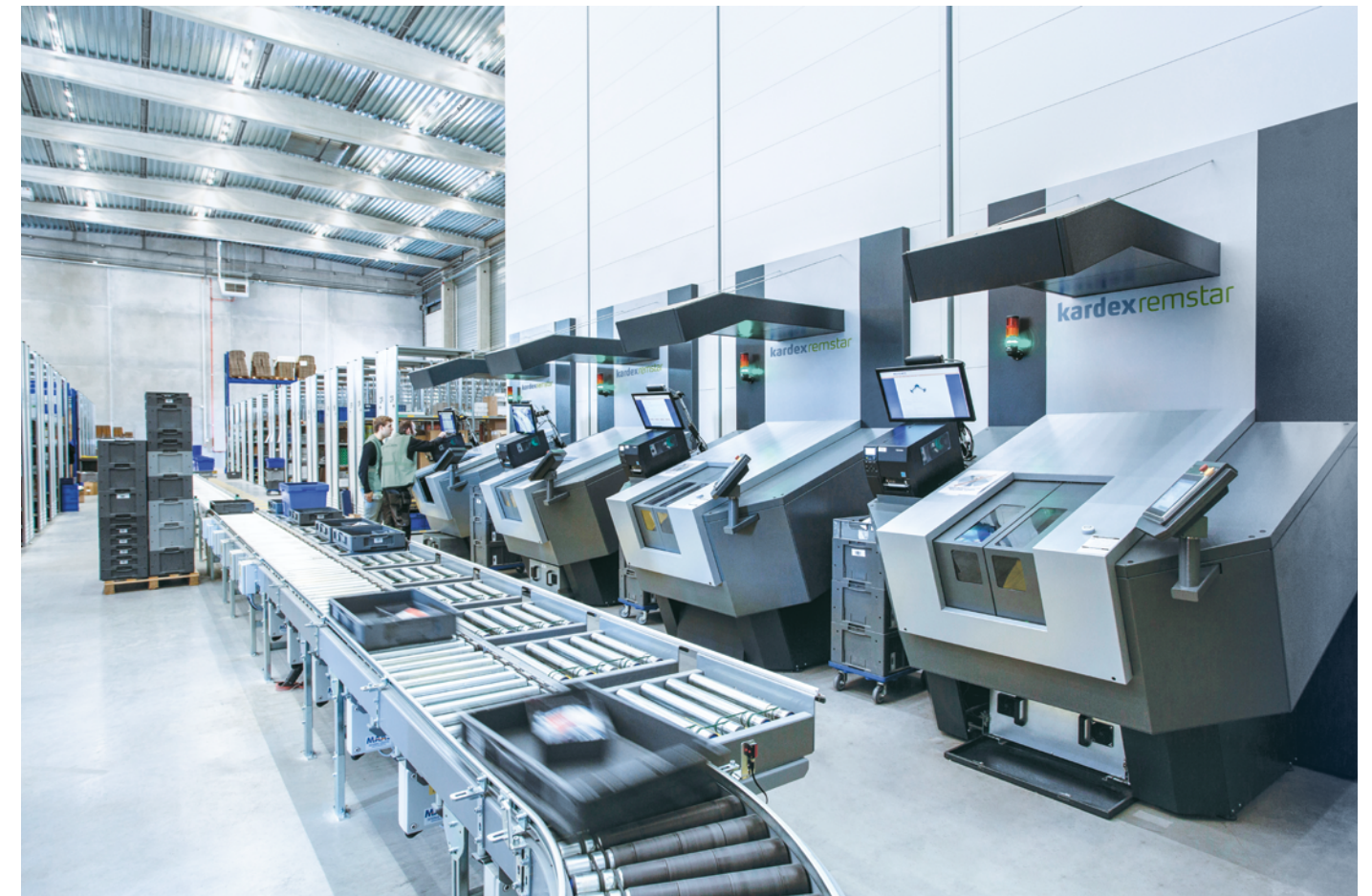
Order picking with turntables and a conveyor system with put locations

Further options and storage environments with air conditioning, fire protection or esd versions are available.