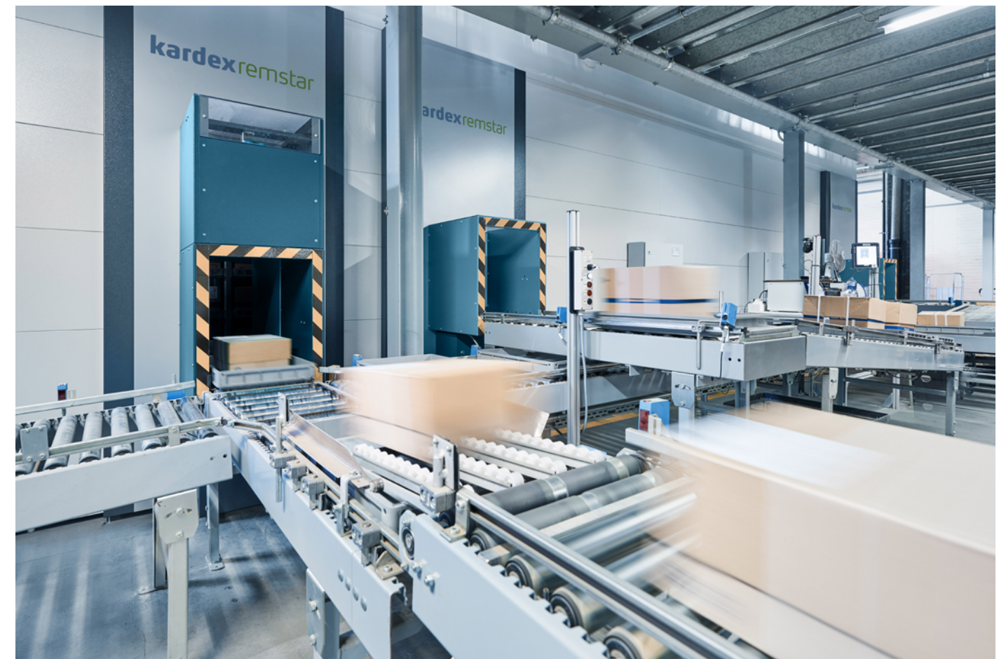
Order consolidation with automatic conveyor connection