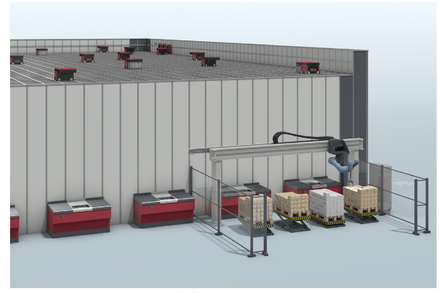
Automated solution with pick and place robotics for (de-)palletizing