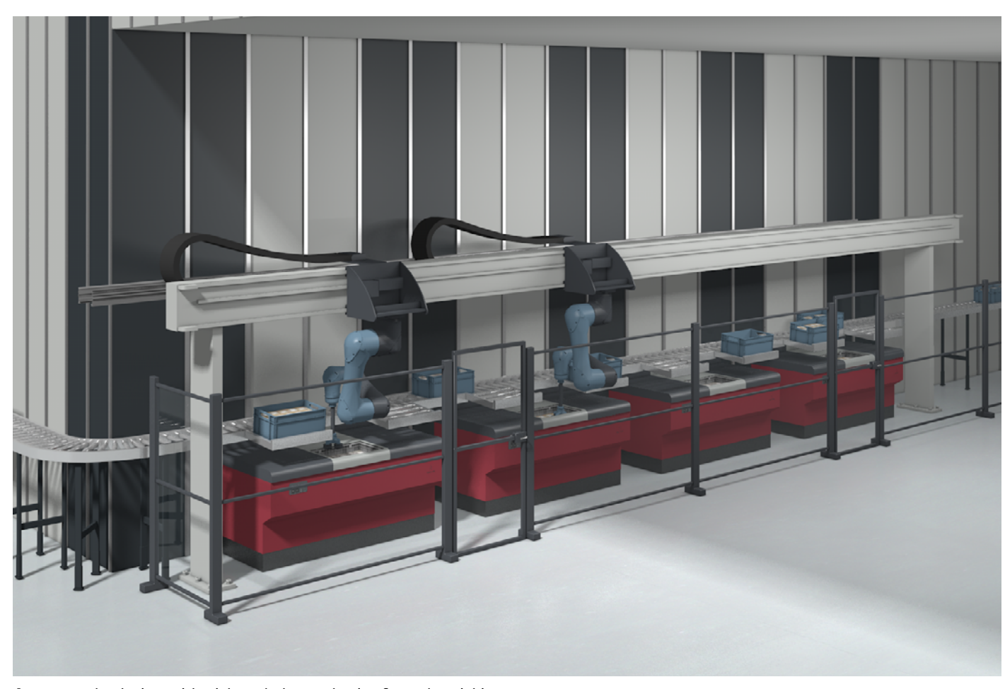
Automated solution with pick and place robotics for order picking