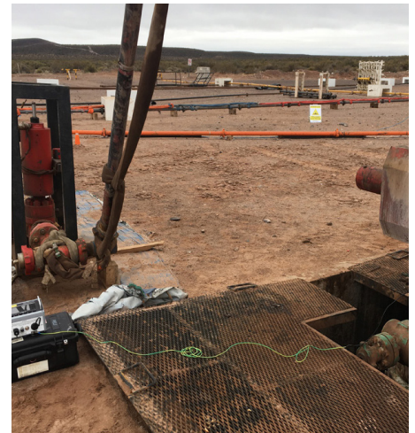
InnerVue™ WellSuite diagnostics equipment setup at the wellsite.

At the time of the operation, the fluid in the well was a mixture of fresh water and liquid hydrocarbon. An acoustic velocity profile along the well was modeled, based on the fluid composition, and considering the pressure and temperature gradients. At surface, after the well fluid column had stabilized, a bleed valve was quickly opened and closed to create a pressure wave.