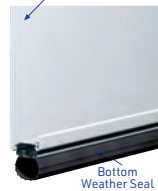
Bottom Weather Seal