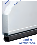
Bottom Weather Seal