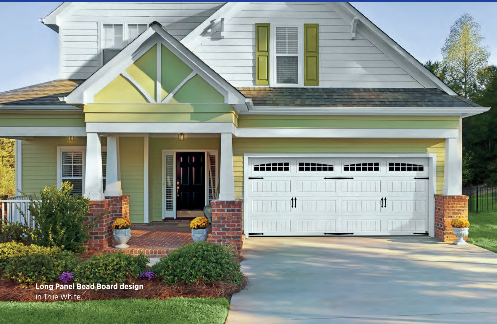
Long Panel Bead Board design in True White.