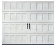
RE • RECESSED