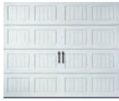
BB • BEAD BOARD

Images shown are for standard door size of 8' wide by 7' tall. Check amarr.com for illustrations of other door sizes.