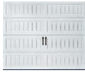
LPBB • LONG BEAD BOARD