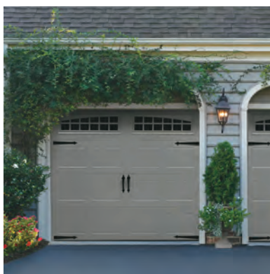
Bead Board Panel with Moonlite DecraGlass in Sandtone and Blue Ridge handles and hinges.